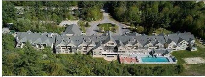
Grand Summit Hotel at Attitash Bartlett, New Hampshire

2025 IRON ADVENTURE RALLY Save The Dates – August 21 to 24, 2025