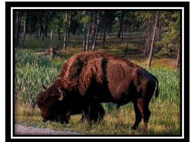
On the way out of town